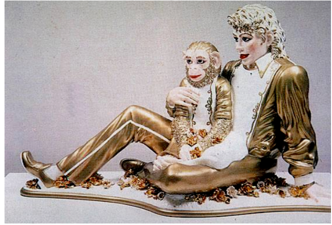
Jeff Koons, Michael Jackson and Bubbles , 1988