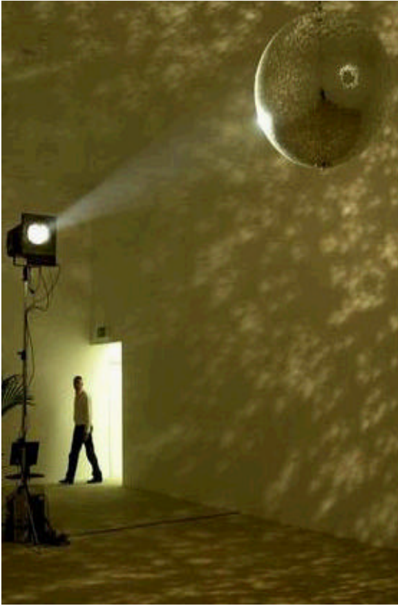
Cerith Wyn Evans, The Accursed Share , 2002.

What does reflect the discursive processes leading up to the exhibition is the unmistakable political and theoretical thrust of the works on view, overwhelmingly dedicated to matters associated with the (primarily negative, and worsening) effects of post-colonialism and globalization. Take for example Cildo Miereles's elegant Disappearing Element/Disappeared Element (Immanent Past), 2002. During the exhibition, strolling vendors sold popsicles for a Euro apiece, each on a stick bearing the work's title. The popsicles, made of water, are of course flavorless and colorless, and quickly melt (disappear) if not consumed, calling attention to political-ecological issues (disparities in world access to plentiful and safe water); world trade issues (water as a vehicle as well as a producer of power); and art-politics issues (the ice melts, thus defying notions of possession and display of artworks).