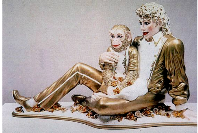
Jeff Koons, Michael Jackson and Bubbles , 1988